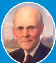
Rtn. Paul Harris Founder